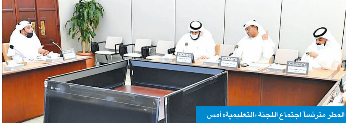
المطر مترئساً اجتماع اللجنة «التعليمية» أمس

المطيري لـ الجريدة: الامتحانات الورقية مرفوضة والمدارس غير جاهزة