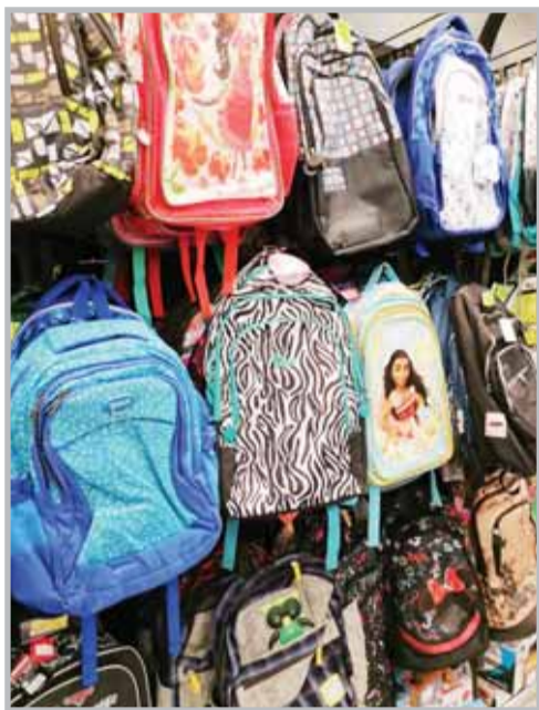
eÉT ØfCQ...ª «SØe ØFEM